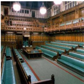
The House of Commons